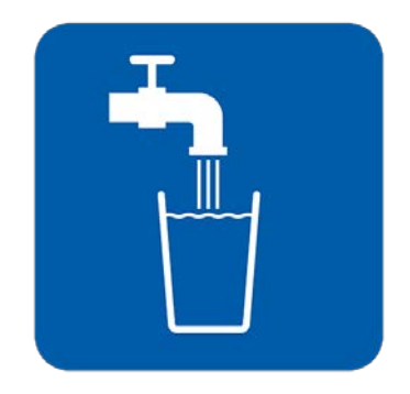
Drink plenty of water