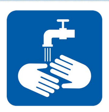
Regularly wash your hands