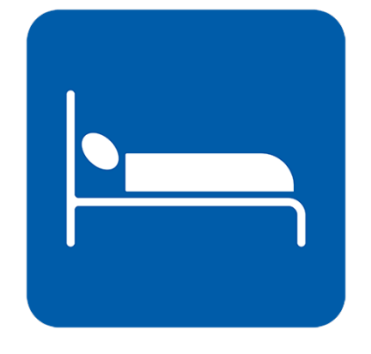
Sleep alone, if possible