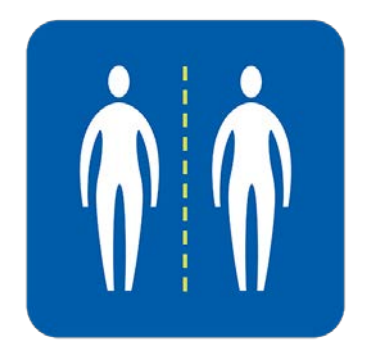
Avoid close contact with other people