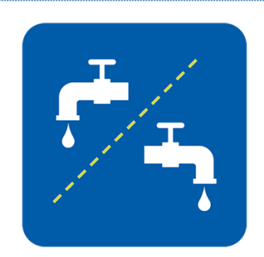
Use separate facilities, or clean between use