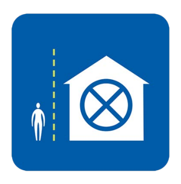
Do not have visitors